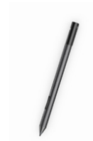
Dell Active Pen – PN557W