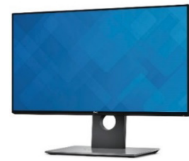
Dell UltraSharp 24 InfinityEdge Monitor – U2417H