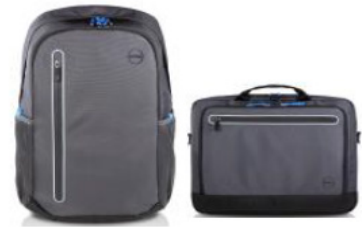
Easy to carry Dell Urban backpack or briefcase.