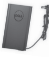
Dell Portable Power Companion (18000 mAh) - PW7015L