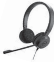
Dell Pro Stereo Headset – UC350