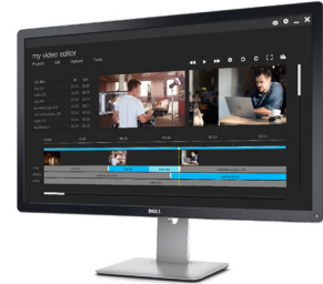
Dell UltraSharp Ultra HD 4K Monitor with PremierColor | UP3216Q