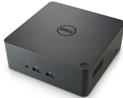
Dell Thunderbolt™ Dock | TB16